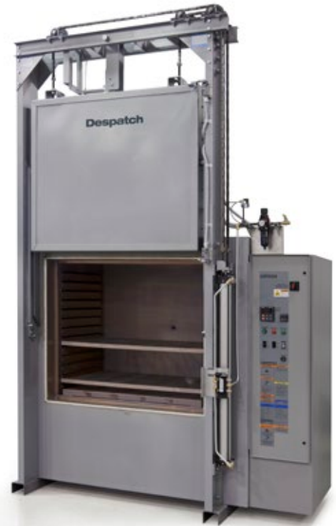
RFF-35 with optional pneumatic lift door