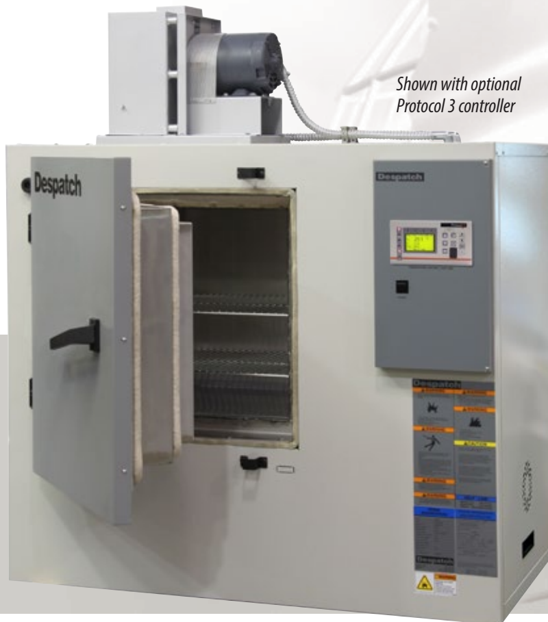
Shown with optional Protocol 3 controller

The RFF is available in cabinet and benchtop models. The cabinet furnace is suited for volume production while the benchtop model, with its small footprint, is ideal for high temperature process development in a laboratory.